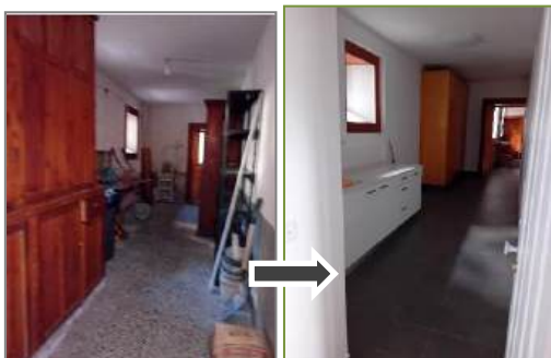
BEFORE and AFTER - CORRIDOR LEADING TO THE SACRISTY