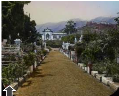
Santa Catarina Park when it was a cemetery (“Cemitério das Angústias”)... and how it is now